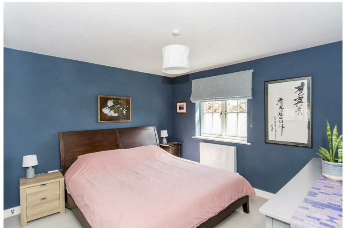
Timber framed double-glazed window to rear. Built in mirrored wardrobes. Radiator.