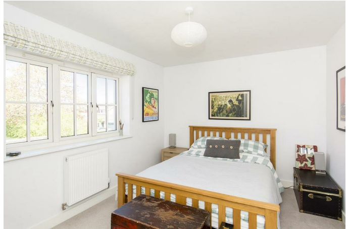
Timber framed double-glazed window to front. Built wardrobe. Radiator.