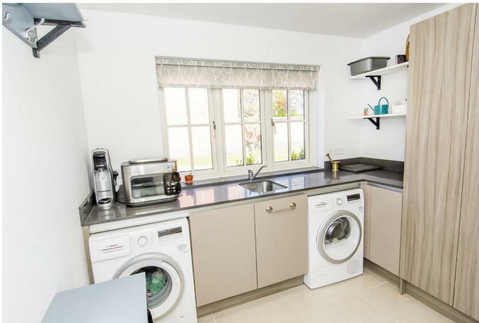
Double-glazed window to front. Composite double-glazed side entrance door. Fitted range of wall and floor mounted units. Space and plumbing for washing machine and dryer. Tiled flooring with under-floor heating.