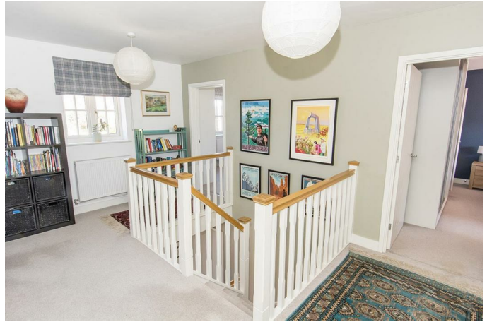
Timber framed double-glazed window to front. Loft access hatch with pull down ladder and boarding. Airing cupboard. Radiator.