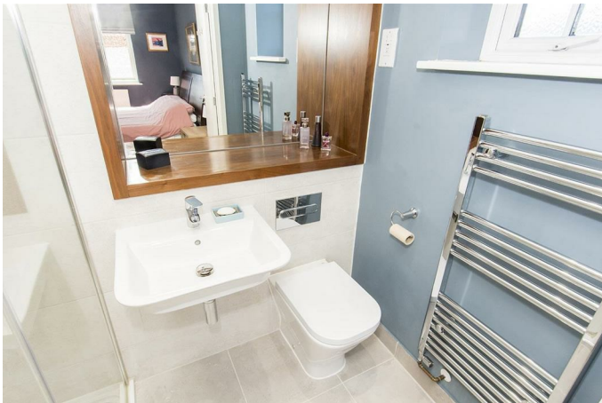
Timber framed opaque double-glazed window to side. WC. Wash hand basin. Shower cubicle with dual shower heads. Heated towel rail. Shaver point. Extractor fan. Tiled splash backs. Tiled floor.